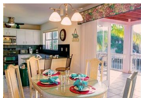
Amenities Include: Central Air Conditioning, Ceiling Fans, High Speed Internet, Ironing Board, Linens, No Phone, Washer & Dryer, Iron, Coffee Maker, Dishwasher, Full Kitchen, Microwave, Stove, Refridgerator, Cooking Utensils and Dishes, Blender, Cable TV, internet, TV in master bedroom, TV living room, Patio, Gas Grill, Hot Tub, seawall/dock, Waterfront, Near Golf Course